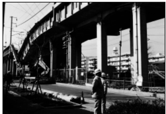
A portion of the Shinkansen (Bullet Train) that collapsed during the earthquake.

Only two limited access highways exist in the narrow transportation corridor. The Hanshin Expressway is carried on single large hammerhead reinforced concrete piers, many of the concrete sections failing in shear and/or flexure over a 20 kilometer length. Along the harbor shore is the Wangan (Harbor) Expressway, a newly elevated highway generally of steel and crossing a number of navigable waterways on major crossings. Many of the steel girders appear to have jumped