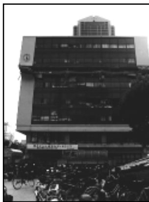
The sixth floor of the old Kobe City Hall collapsed.

Well in excess of 100 mid-rise buildings constructed during the 1960's and 1970's from reinforced concrete were observed to have failed, in many cases catastrophically. Most failures appear to have been shear failures of columns, which were observed to have very light transverse reinforcement. A number of mid-height single story pancake collapses were observed. An example was the 1960's vintage eight-story Kobe City Hall, which sustained a complete collapse of the sixth floor, while the neighboring 1980's vintage 16-story New City Hall was undamaged.