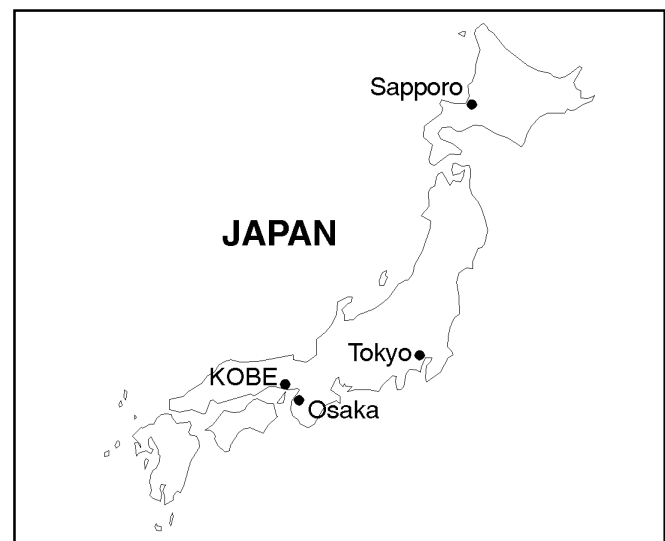
Kobe is situated to the west of Tokyo on the southern coast of Honshu Island.

While the official name of the event is the Hyogo-ken Nambu earthquake, the disaster is increasingly being referred to in Japan as the Hanshin Daishinsai (Osaka-Kobe Great Earthquake Disaster). This region is not as seismically active as the Tokyo area and some other parts of Japan, but has experienced magnitude 7 or greater events in historical times (eg, 1956). A