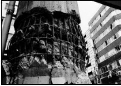
Detail of flexural failure to Monorail column.

the high level of vertical ground acceleration due to brittle fracture of welded parts, separating the four sides of the box column into four independent plates. This is reminiscent of brittle fracture of welded joints of