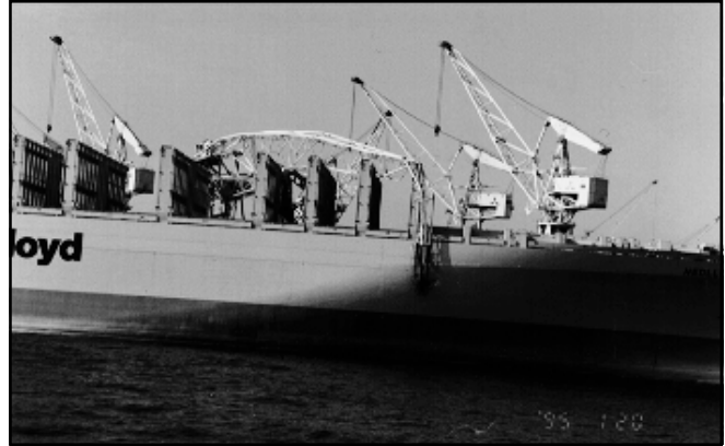
Crane collapse due to ground subsidence caused by liquefaction.

There also has been damage to underground rapid transit facilities. The Daikai Station of the Kobe Rapid Transit Railway has collapsed. The station was built by cut-and-cover techniques. The collapsed portion is approximately 100 m long. It is a reinforced concrete box structure, 5.5 m high and 15.3 m wide at a depth of 4.6 m from the street surface to the top of the structure. Preliminary information indicates that the station was constructed in sands underlain by stiff clay. The central reinforced concrete columns of the station failed, apparently by a combination of shear and vertical loading. There was only nominal confining steel (9 mm diameter on 180 mm spacing) for the 20 mm diameter longitudinal rebar on 140 mm centers in the concrete. Collapse of the columns caused subsidence at the street surface of a maximum 2.5 m, with substantial settlement over an area of 100 m by 20 m. Apart from the structural collapse-induced movement, there was no clear evidence of permanent ground deformation at the site induced by other causes, such as liquefaction.