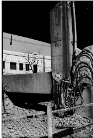
A detailed view of a sheared column which supports the Shinkansen.

Rail facilities were particularly hard hit in this earthquake (for further information on damage to underground rapid transit facilities, see article by Thomas O'Rourke on page 6). Three main lines (JR West, Hankyu and Hanshin) run through the corridor, in general on elevated embankments, and all sustained embankment failures, overpass collapses, distorted rails and other severe damage. In Kobe, the Shinkansen (Bullet Train) is generally in a tunnel through Rokko Mountain. No information was available regarding the tunnel. At the east portal of the tunnel, the line is carried on an elevated viaduct, built in the 1960's. For a length of three kilometers, this viaduct was severely damaged, with a number of the longer spans collapsing. In general, these collapses were due to shear failure of the supporting columns.