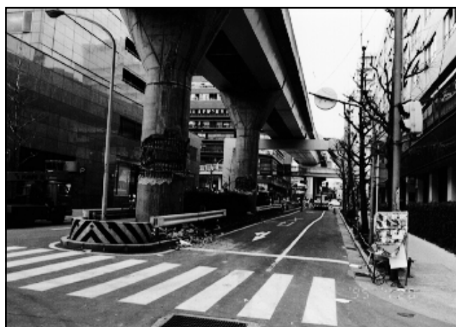
Flexural failure and skewed monorail column.

Liquefaction was particularly destructive for Kobe's port facilities including those located on Port Island and Rokko Island, both built on reclaimed land. Derricks and cranes were either severely damaged or made unusable due to liquefaction-induced ground deformation. The Kobe area port facilities were constructed under the Ministry of Transportation's Construction Standard B (as opposed to more stringent A and Super A Standards). After the fact, and considering the importance of Kobe's facilities in that they handle 30% of Japan's container freight traffic, this is now considered substandard. Current Japanese seismic codes do not consider importance factors.