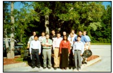
■ SLC students were joined by MCEER's REU students at this year's retreat.