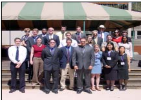
■ Attendees at the 2002 REU Symposium pose for a group picture.

Culminating the eight-week internship, students from across the nation converged in Keystone, Colorado for the 2002 student symposium. This year's event was organized by the MAE Center. Seventeen students from the three earthquake centers assembled at the beautiful Keystone ski resort for two days of presentations, educational field trips and some adventure. Although the forum was entirely professional, the atmosphere remained relaxed and comfortable throughout the weekend. A variety of research projects relating to earthquakes were presented and discussed, which served to further exemplify the numerous options available to them in the earthquake engineering field.