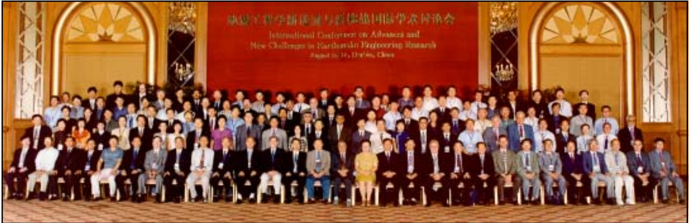
■ Participants at the Harbin conference gather for a group photograph.