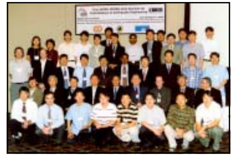
■ The KEERC-MCEER workshop provided an opportunity for graduate students from both Centers to meet and share their research in a formal setting.

The first KEERC-MCEER Joint Seminar on Contributions to Earthquake Engineering was held in Buffalo, New York on July 30 – August 1, 2002. It was sponsored by the Korea Science and Engineering Foundation, National Science Foundation, Brain Korea 21, and MCEER.