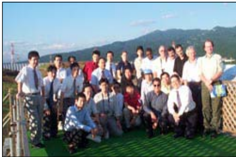
■ Participants visited several bridges under construction by the Japan Highway Public Corp as part of the study tour.

The Third International Workshop on Performance Based Seismic Design and Retrofit of Transportation Facilities was held in Tokyo, Japan on July 9-11, 2002, at the Tokyo Institute of Technology. The meeting was followed by a one-day study tour in the Tokyo area. The Federal Highway Administration sponsored the U.S. delegation. The first two workshops in the series were organized by the National Center for Research in Earthquake Engineering (NCREE), Taipei, Taiwan, and held in July 1999 and September 2000, in Taipei.