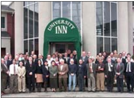
■ Participants at MCEER's Annual Meeting pose for a group photo outside the University Inn and Conference Center in Buffalo.

The first joint meeting of the IAB/MCEER Executive Committees was held at the annual meeting in March. As a result of this meeting, specific research activities were identified as key to the