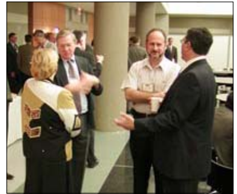
■ Workshop participants exchange perspectives between sessions.

Proceedings are currently being assembled, and will contain introductory material prepared by the Steering Committee, short biographic material from all