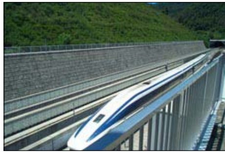
■ The study tour participants rode the Maglev train, which can reach speeds of up to 450 km/hr.

The workshop allowed participants to review the state of performance-based design of bridges in the U.S., Japan and Taiwan, and discuss some of the key issues that must be addressed to ensure effective implementation of this design concept. About 50 people participated in