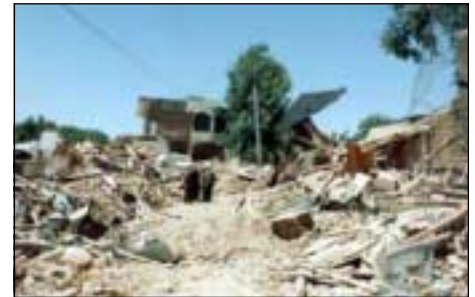
■ Devastation in Changureh, Iran.

miles east of the epicenter. The latest reports indicate that the death toll is 261, the number of injured exceeds 1,300 people, and over 25,000 people are homeless.