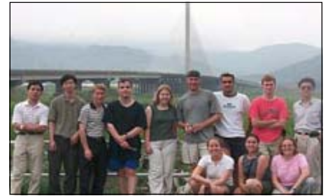
■ The Field Mission Team pose in front of the Chi-Lu Bridge, which was under construction at the time of the 1999 Chi-Chi earthquake. The bridge suffered some damaged and is not yet open to traffic.

After their return to the U.S., the students have been asked to make at least two presentations during the fall 2002 semester based on information they learned during the trip. One presentation is to be given to groups of students or adults in the U.S. that do not have an academic